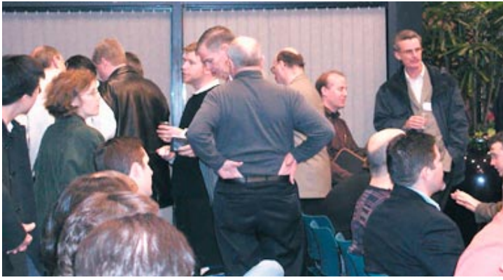
HyperLink Forums: There's "a whole lotta networking going on" at the January HyperLink discussion group on Enterprise Software Comes to the Web .

building a stronger, more diverse US workforce in science, engineering and technology by increasing the participation of under-represented groups (women, minorities, people with disabilities).