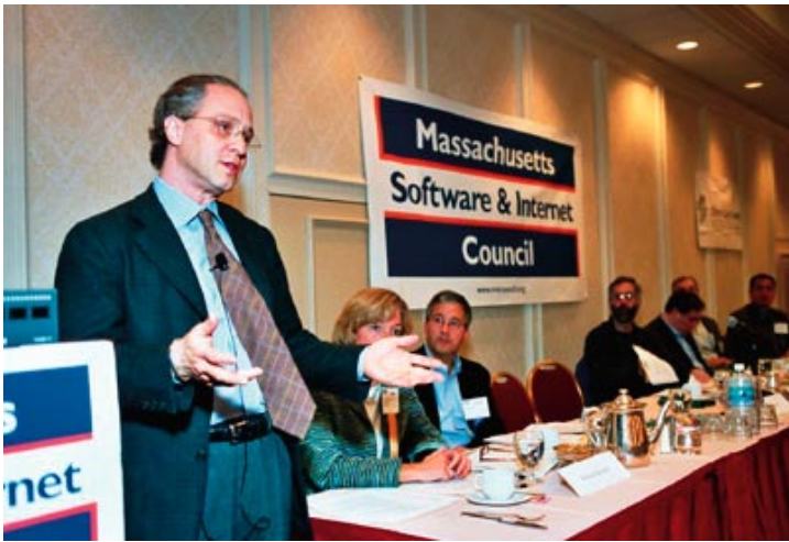
Spring Meeting: Council Trustee and Keynote Speaker Ray Kurzweil , Kurzweil Technologies , speaks as the head table looks on.