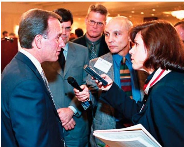
Fall Meeting: Keynote speaker Ivan Seidenberg, CEO of Verizon , answers questions for the press after his presentation.

The Council also organized more than 12 business to business networking events among members, investors, and other important service firms and constituencies where connections